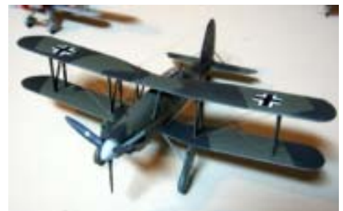
Brian Baker brought in this 1/72 Fieseler Fi-167 built from the MPM kit.