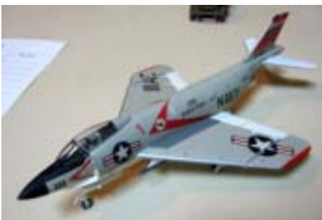
Mike Mackowski made the old 1/72 Emhar F3H Demon look like a state-of-the-art kit.