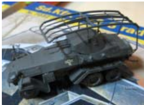
This 1/72 Italeri Sdkfz 232 was built by Jim Pearsall.