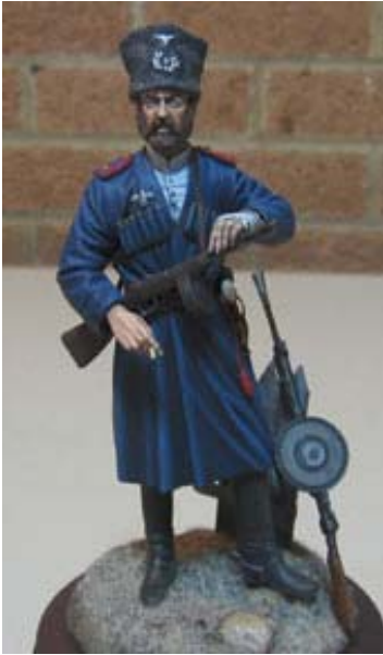
Jim Stute's 120mm Cossack from the Verlinden kit.