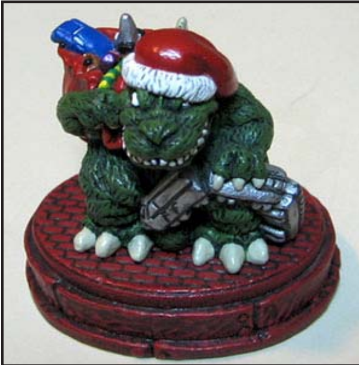
Brian Fisher is at it again with Santazilla. Brian used the Mad Labs kit to spread a little holiday cheer.