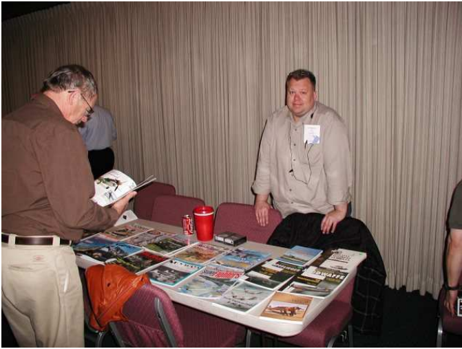
Some more of the club members.