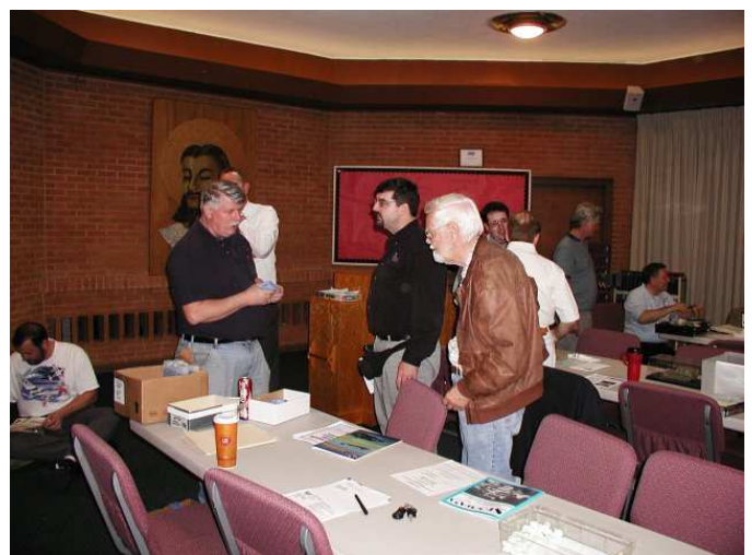
Some of the club members.