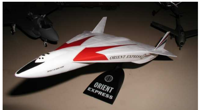
Monogram "Orient Express" National Aerospace Plane by Phillip Park.