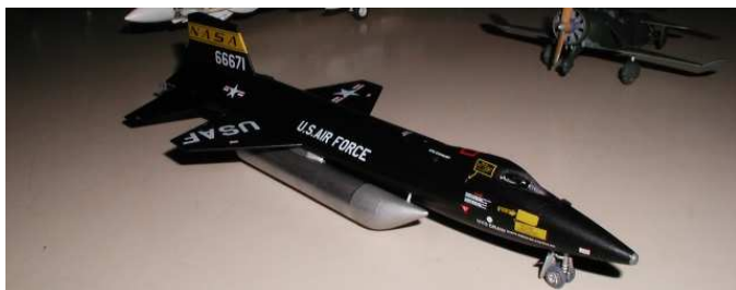
Mike Mackowski's 1/72 nd scale Revell-Monogram X-15.

Here are some pictures of the other models brought to the club meeting: