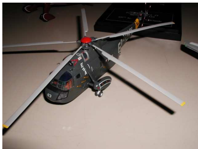
Chuck Ludwig's 1/72 nd scale Airfix Sea King.