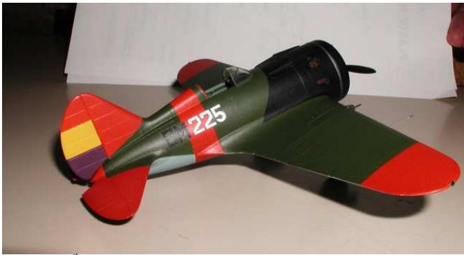
1/48 th scale HobbyCraft Polikarpov I-16 by Keenan Chittester.