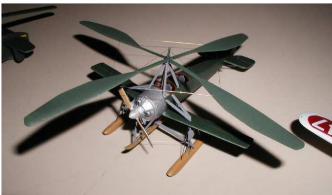
Brian Baker's 1/48th scale A-Model Icamor - Shezinski Kaser-2.